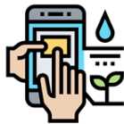
Agriculture / Livestock monitoring